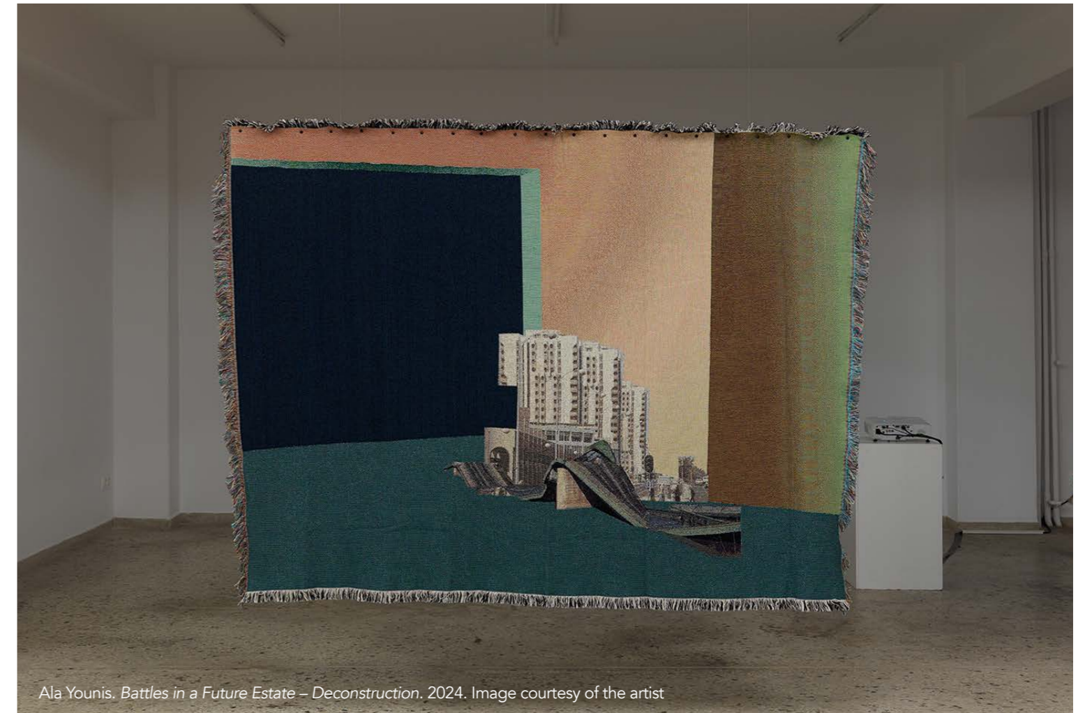
Ala Younis. Battles in a Future Estate – Deconstruction. 2024.

reflecting on the circulation strategies and impact on young readers. Interestingly, each issue remained current for only one week – mirroring the lifespan of cut flowers in the wholesale market, where they lose approximately 15 per cent of their value each day and survive for about seven days.