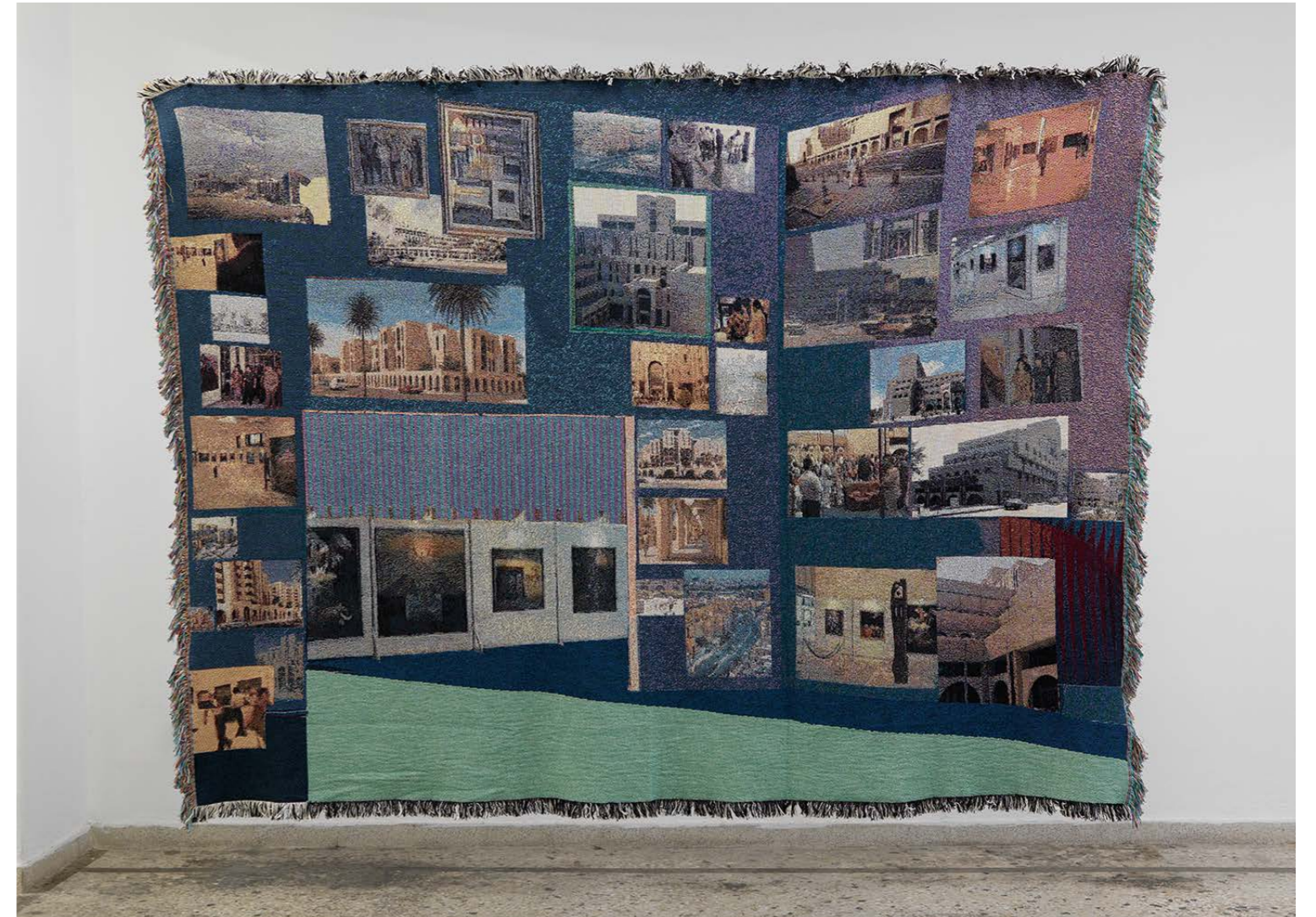
Ala Younis. Battles in a Future Estate – Museum . 2024. Jacquard-woven cotton textile. 150 x 205 cm.

They explain how it evokes memories, feelings and histories of a particular place, somewhere that exists in both real and imagined worlds.