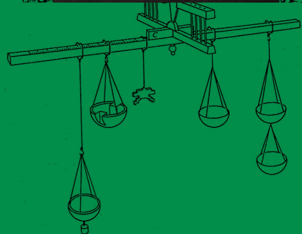
Ala Younis. Trading Fragility. 2026.